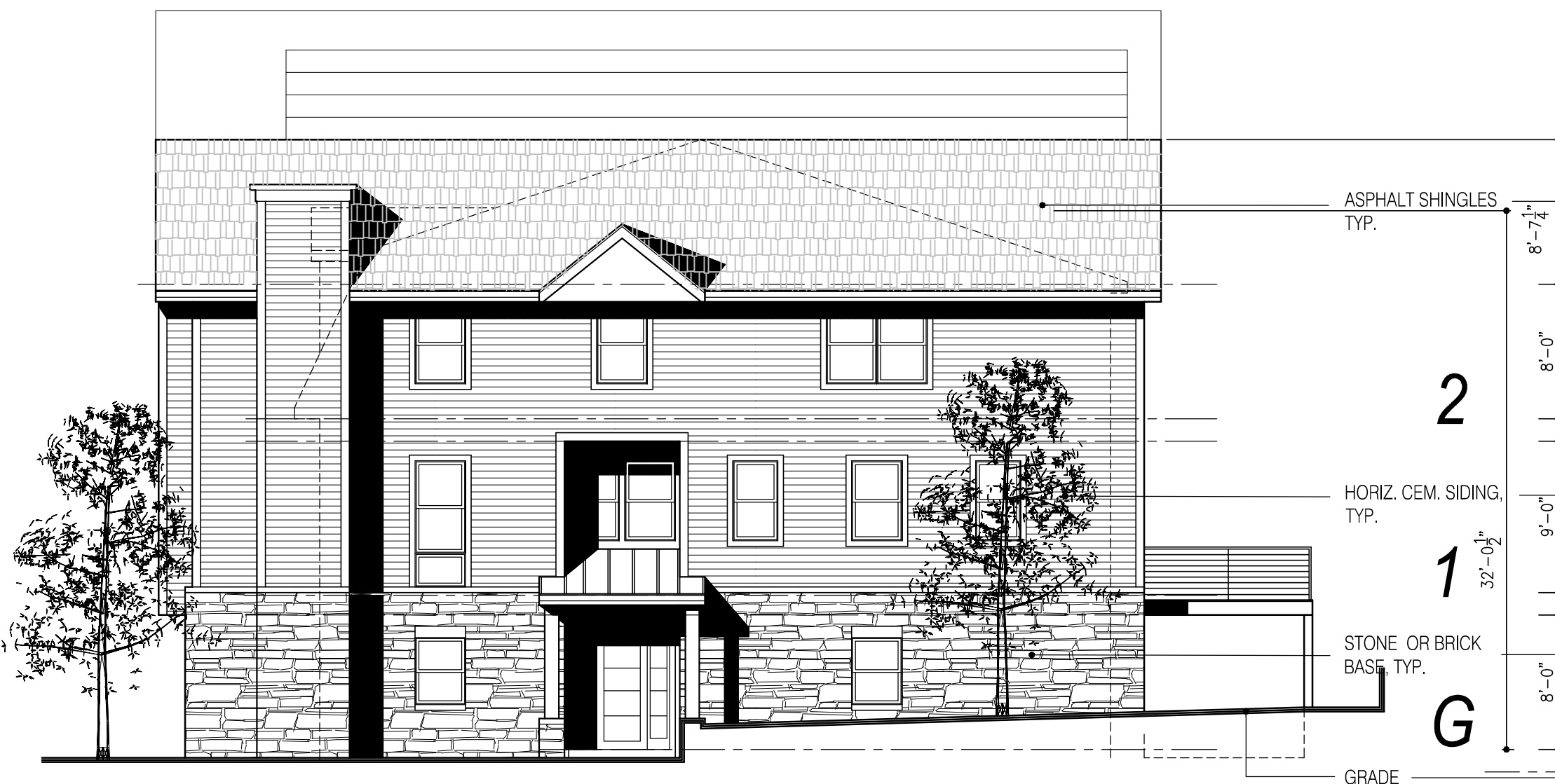
Street (South) Elevation