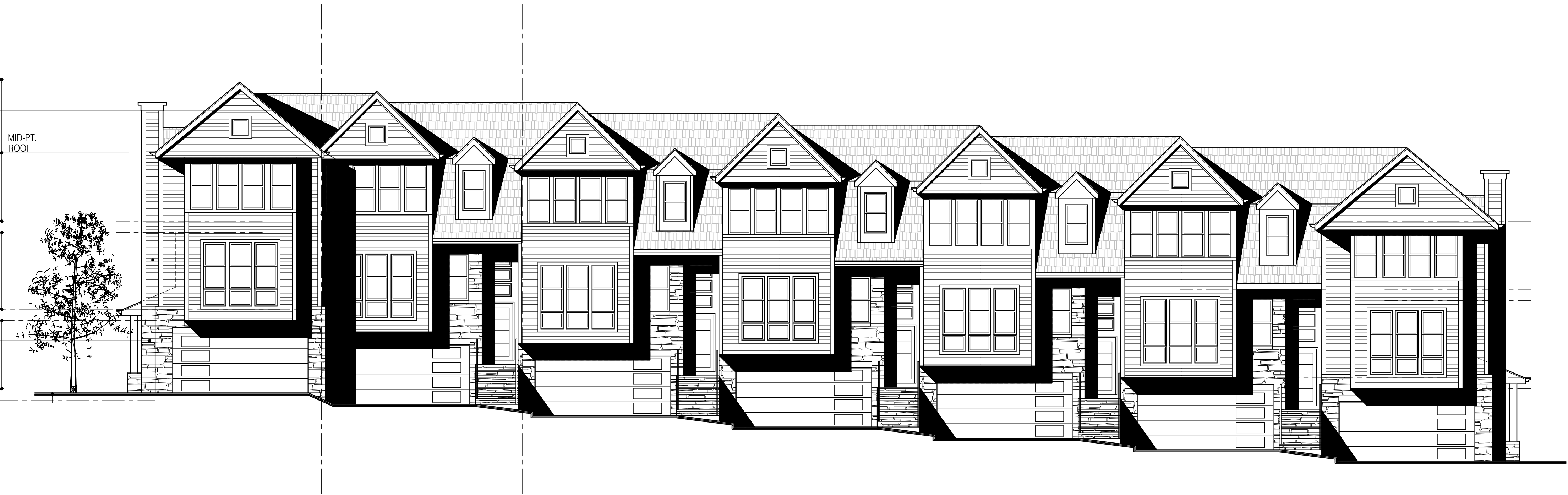
Front (West) Elevation