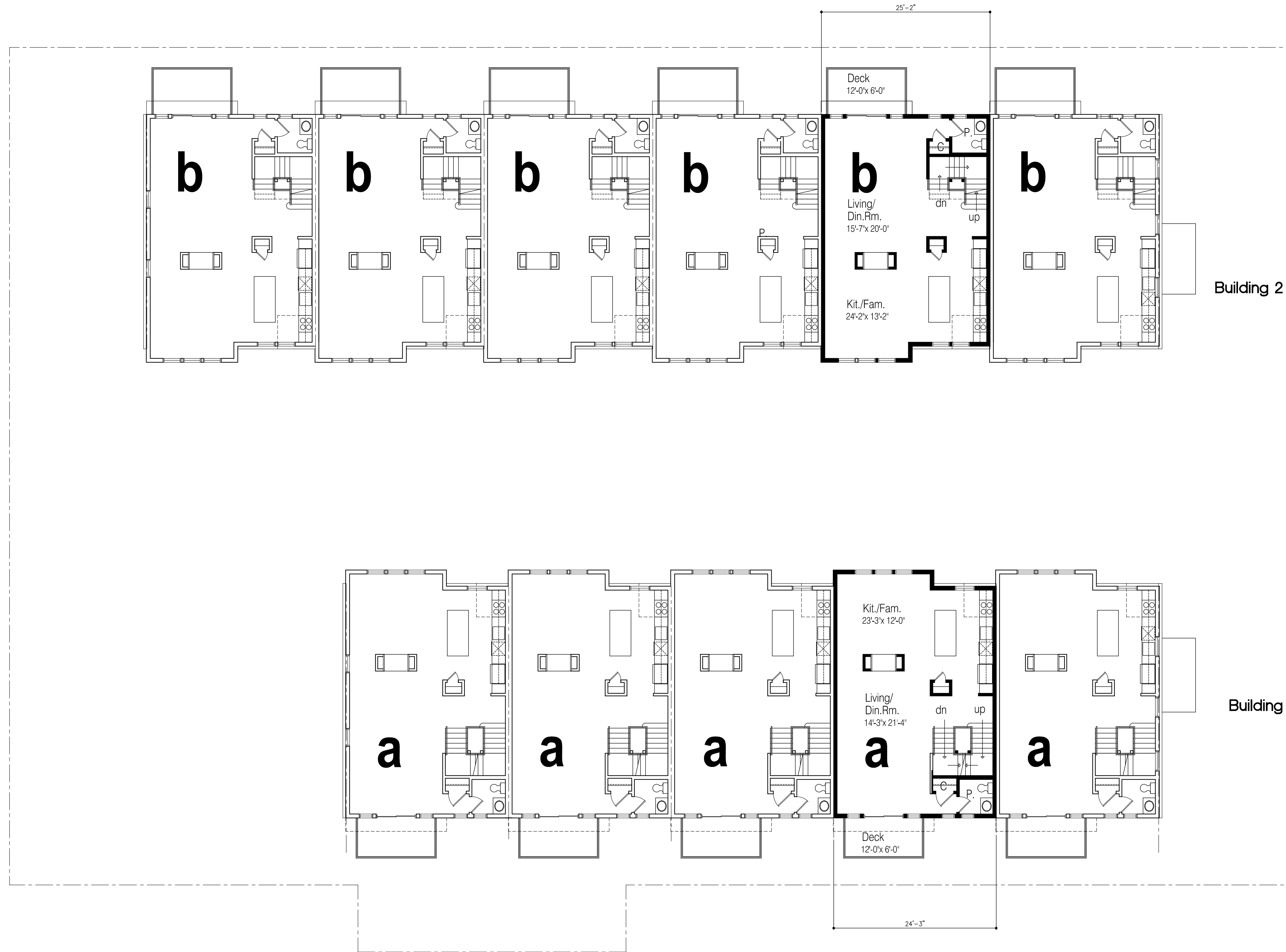
First Floor Plan 1/8" = 1'-0"