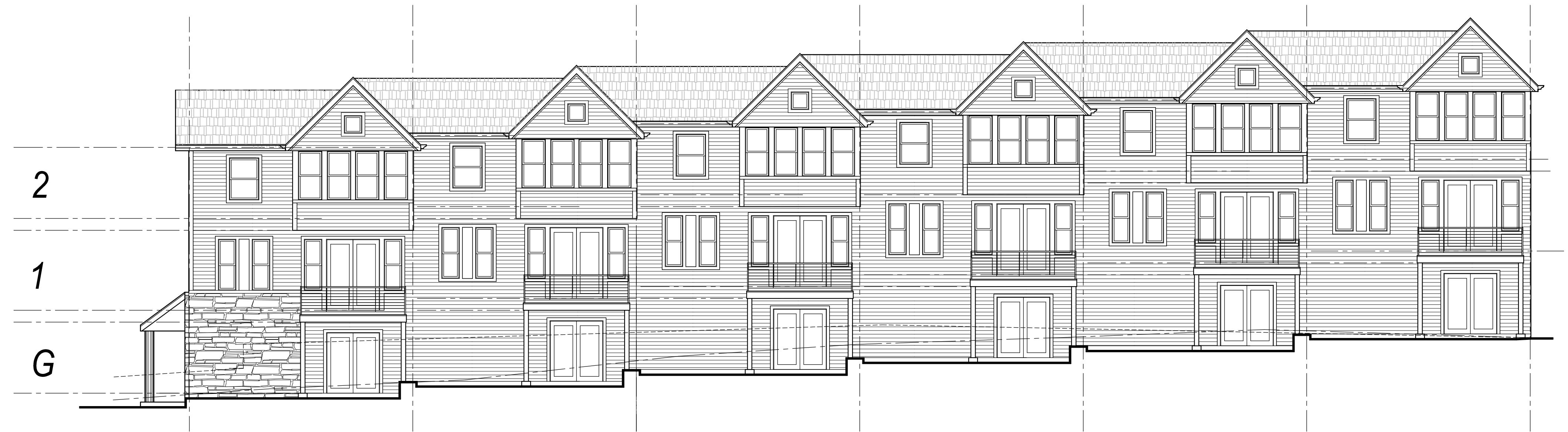
Rear (East) Elevation - Building 2 1/8" = 1'-0"