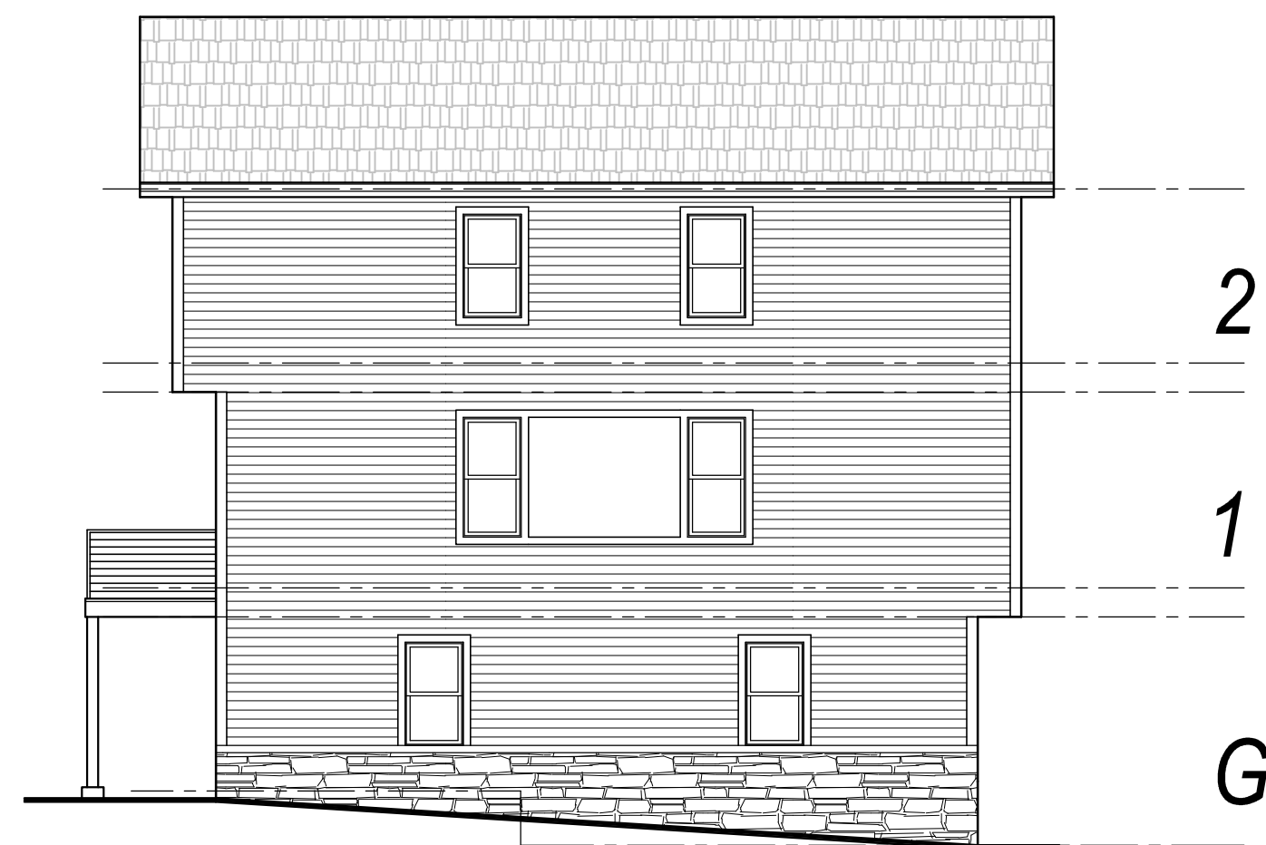
Rear (North) Elevation - Building 2 1/8" = 1'-0"