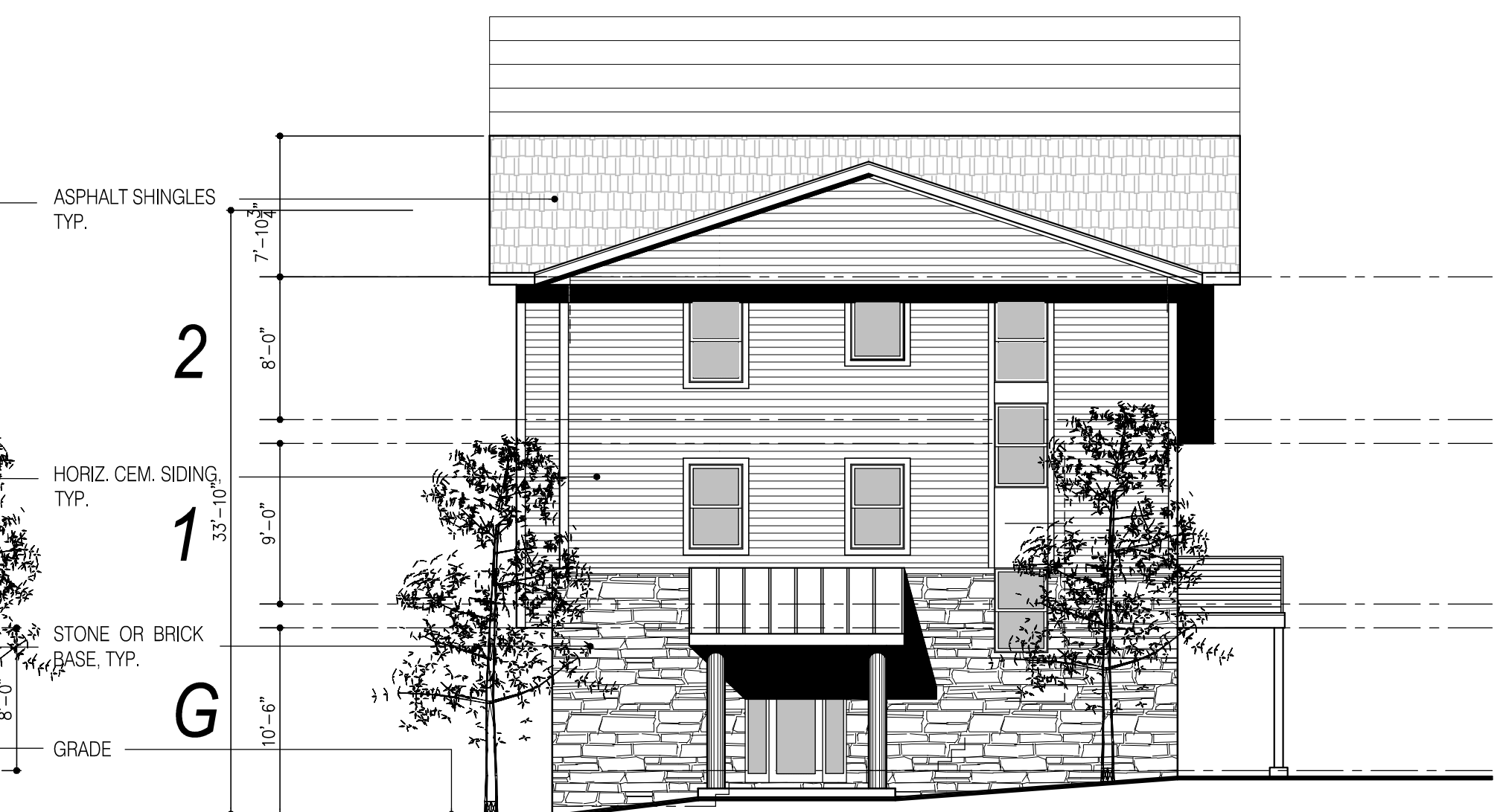
Street (South) Elevation - Building 2 1/8" = 1'-0"