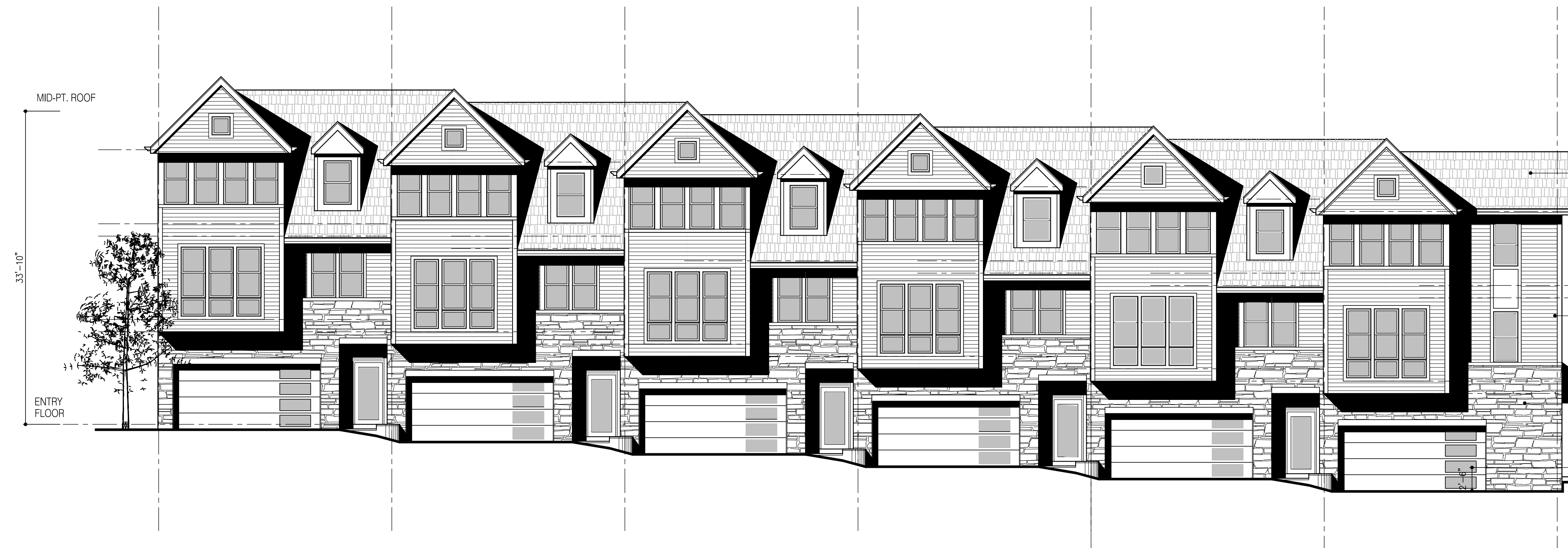
Front (West) Elevation - Building 2 1/8" = 1'-0"