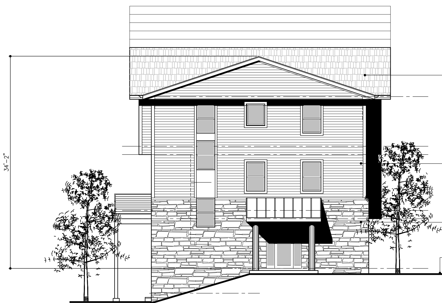
Street (South) Elevation - Building 1