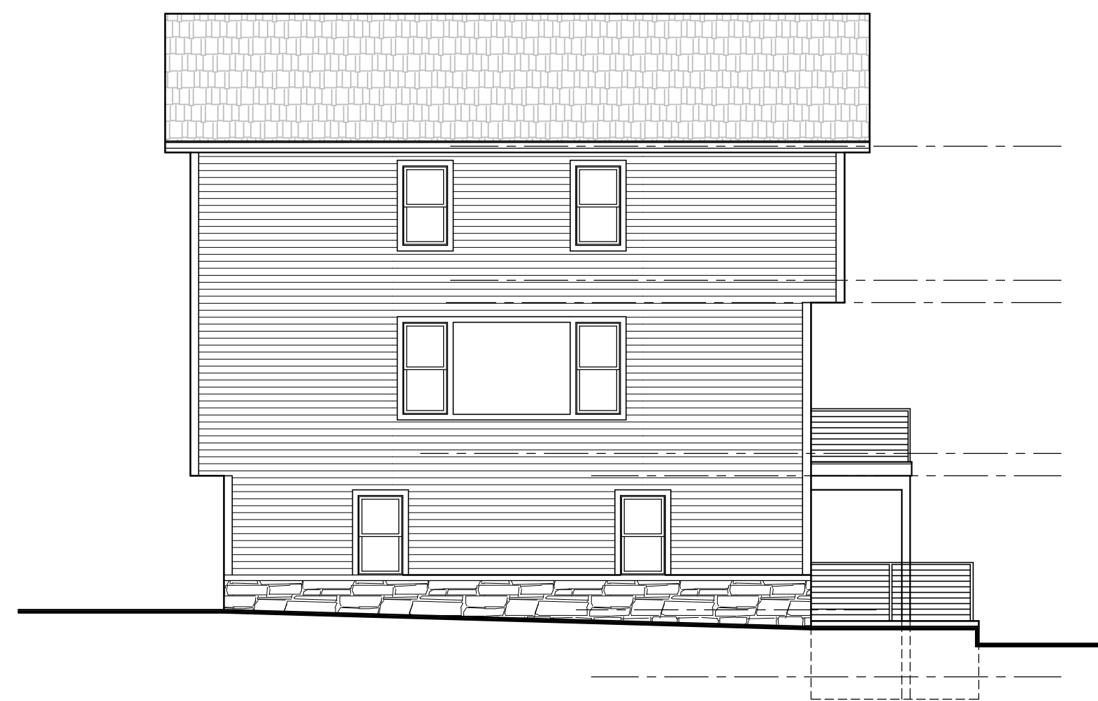
Rear (North) Elevation - Building 1