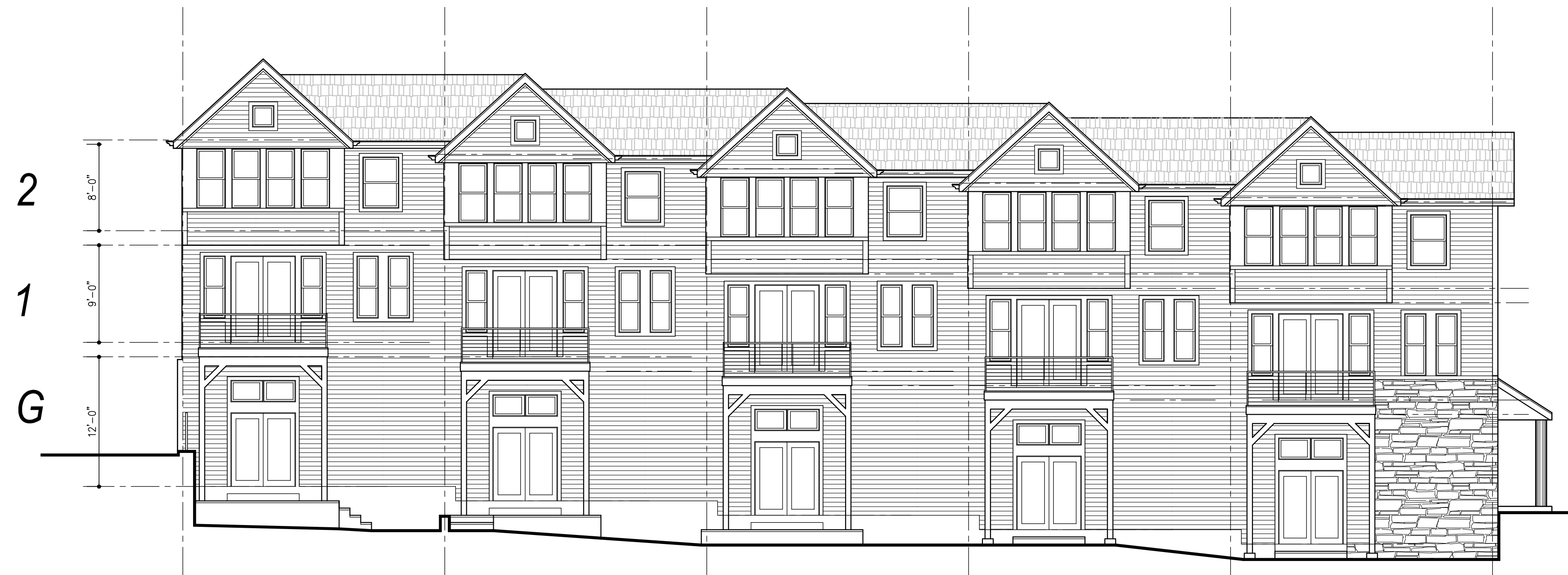
Rear (West) Elevation - Building 1