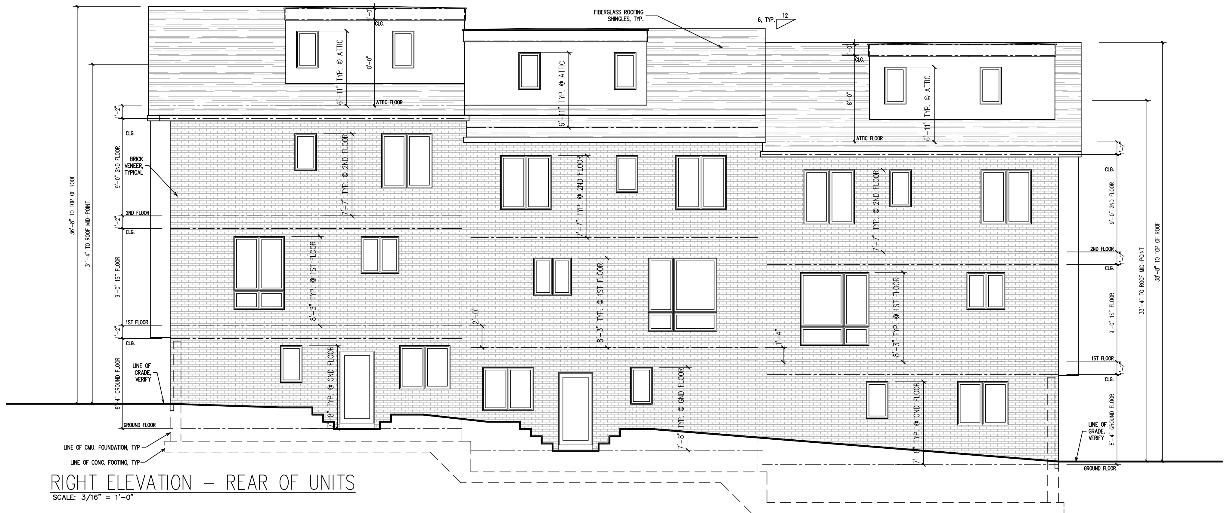
RIGHT ELEVATION - REAR OF UNITS SCALE: 3/16" = 1'-0"