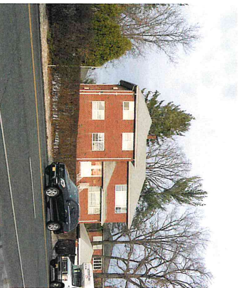
311 EAST EDSALL BOULEVARD BOROUGH OF PAUSADES PARK, NJ Community Housing & Planning Associates, Inc.